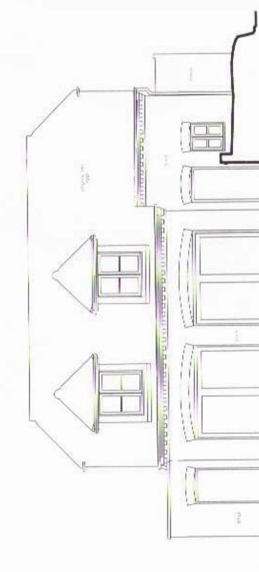
South west elevation